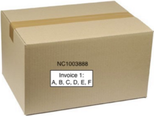
Package 1: products A, B, C, D, E, F