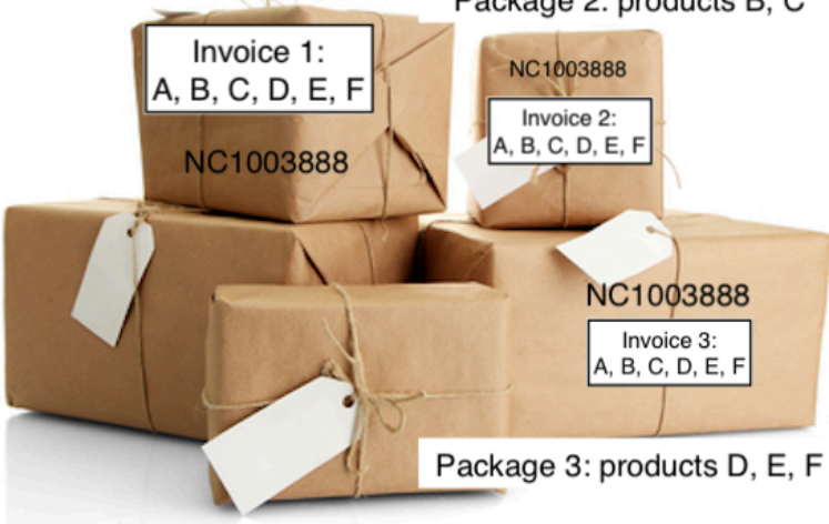
Package 3: products D, E, F